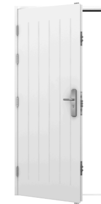
PAS 24 Cottage