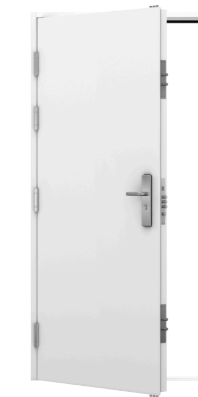
STS202 BR3 Flush