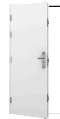
PAS 24 Flush