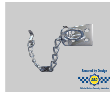
TS003 Door Chain