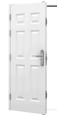
PAS 24 Panelled