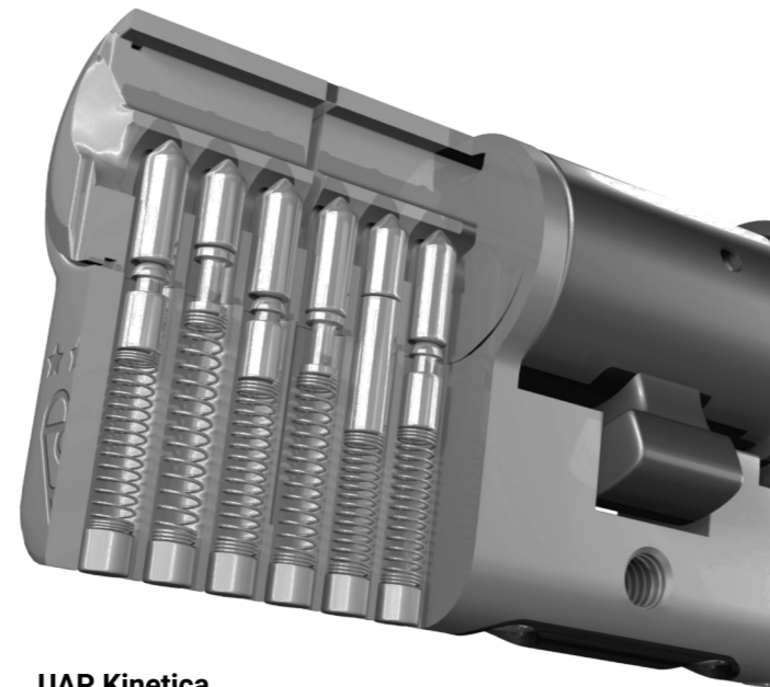
UAP Kinetica 3* Kitemarked Cylinder