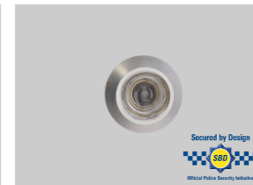
TS002 Door Viewer