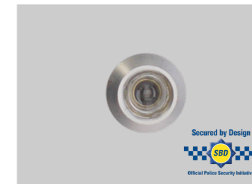
TS002 Door Viewer