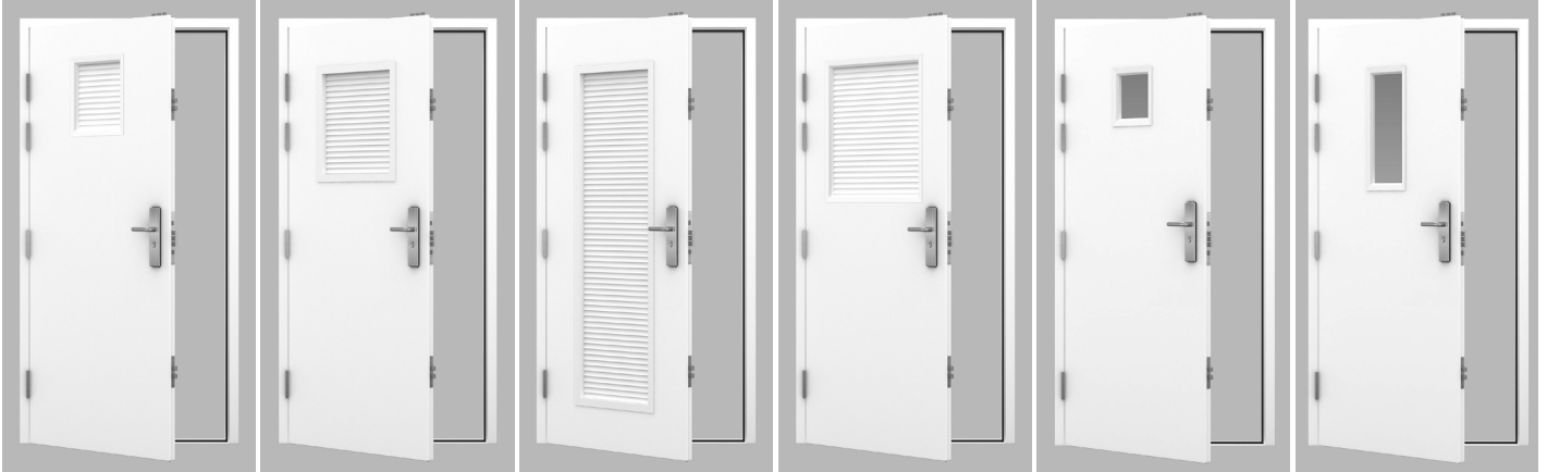
327mm x 327mm Louvre Panel