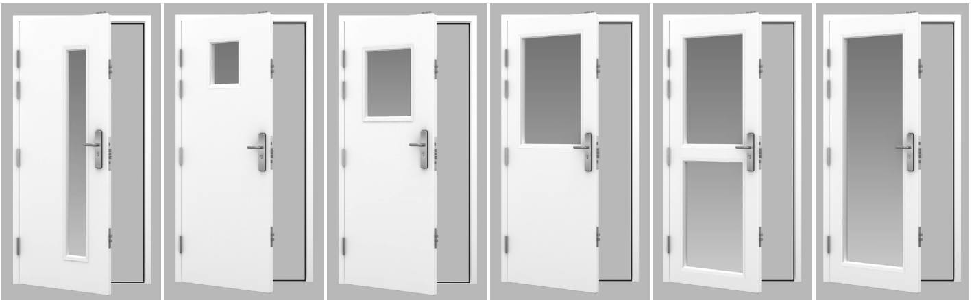
225mm x 1543mm Vision Panel